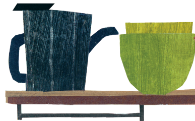
Illustration © Mique Moriuchi from The Perfect Sushi